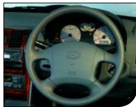
Leather Steering Wheel and Instrument Panel