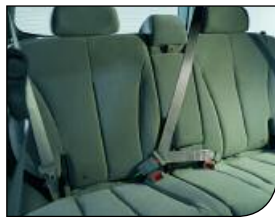
3 x 3 Point Rear Seatbelts