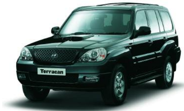
Ebony Black (Solid)

With solid, metallic and mica paint choices we have provided great finishes that allow you to blend in or, when you need it, stand out in a crowd.