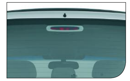
High Mounted Rear Brake Light