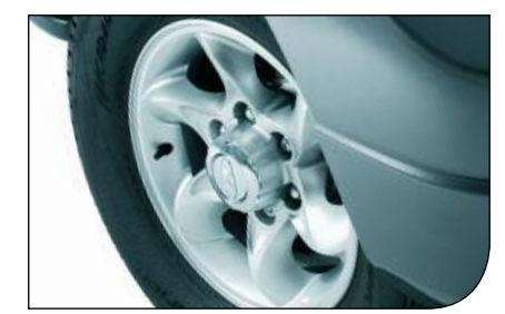
16" Alloy Wheel

16" alloy wheels, roof rails, side steps and powerful long range headlights aligned with front projection fog lights, all give the Terracan looks that match its performance.