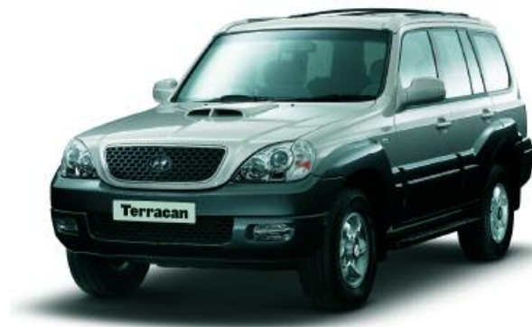
Warm Silver (Metallic)