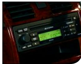
Stereo RDS Radio/CD Player