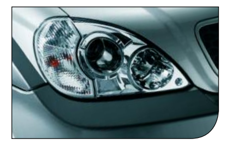
Long Range Headlights