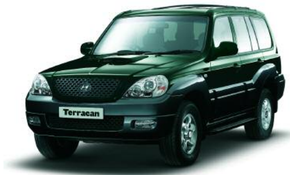
Prime Green (Mica)

A metallic finish is achieved by adding aluminium flakes to the paint and then applying a coat of clear lacquer. The mica finish adds an extra depth of lustre with the inclusion of mica particles in the paint layer.